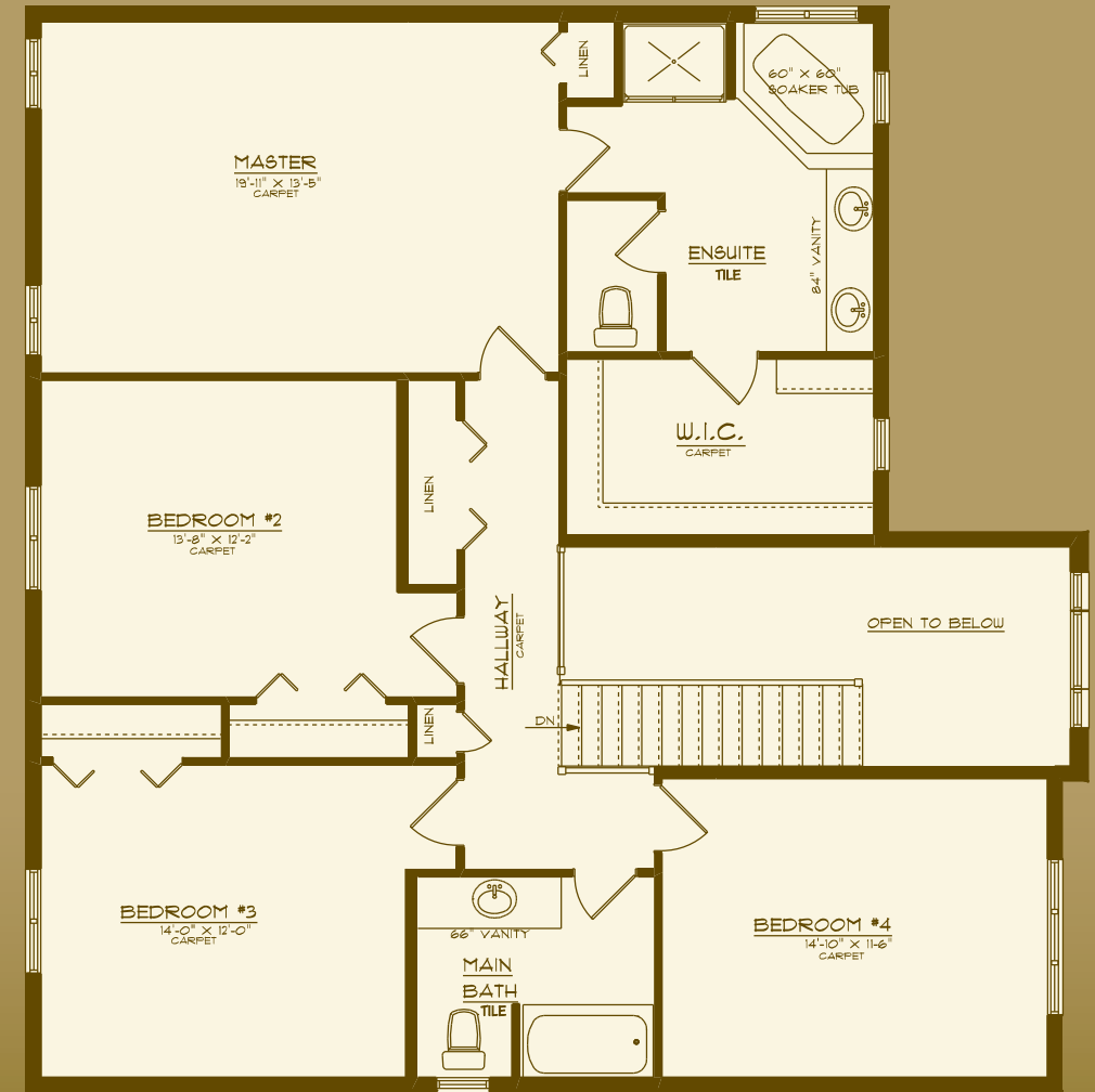
Upper Floor 1,536 Sq. Ft.